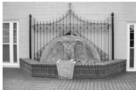
The SMA eagle display, part of the Memorial Wall outside the SMA/VWIL Museum.