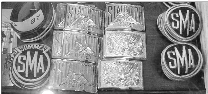
Belt Buckles and Shoulder Patches

Mail to: SMA-VWIL Museum P. O. Box 958 Woodrum Station Staunton, Virginia 24402-0958 or FAX this order form to (540) 885-1366 or e-mail your order to SMAOffice@sma-alumni.org