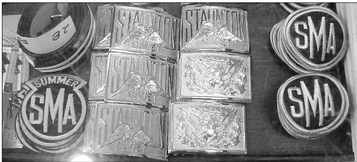
Belt Buckles and Shoulder Patches

(Gold belt buckle not currently available)